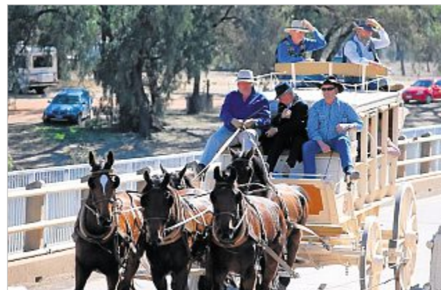
MAKE THE TREK: The 90th anniversary of the last coach service by Cobb & Co which ran from Surat to Yuleba in 1924 will be celebrated on August 22-23.